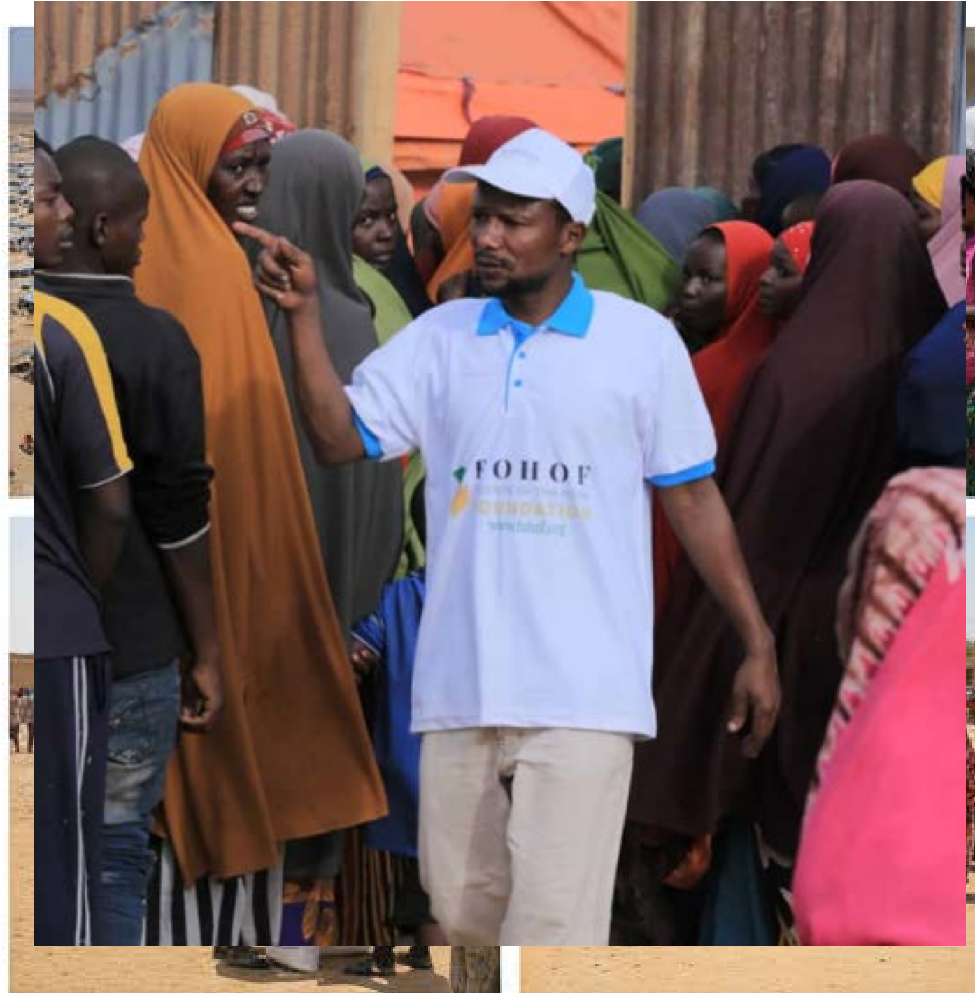
Reinforcing FOHOF's Scale, Reach, and Operational Credibility.